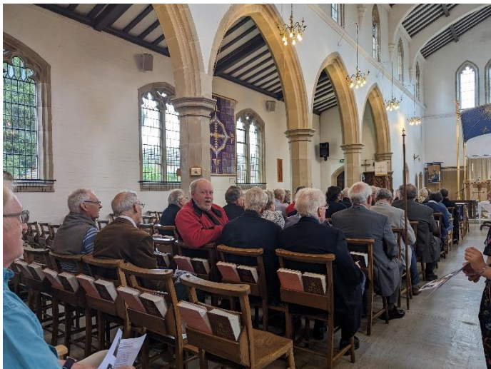
VIEW INSIDE ST. JOHN'S CHURCH